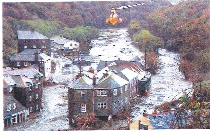
The location of the village, within the Valency valley.