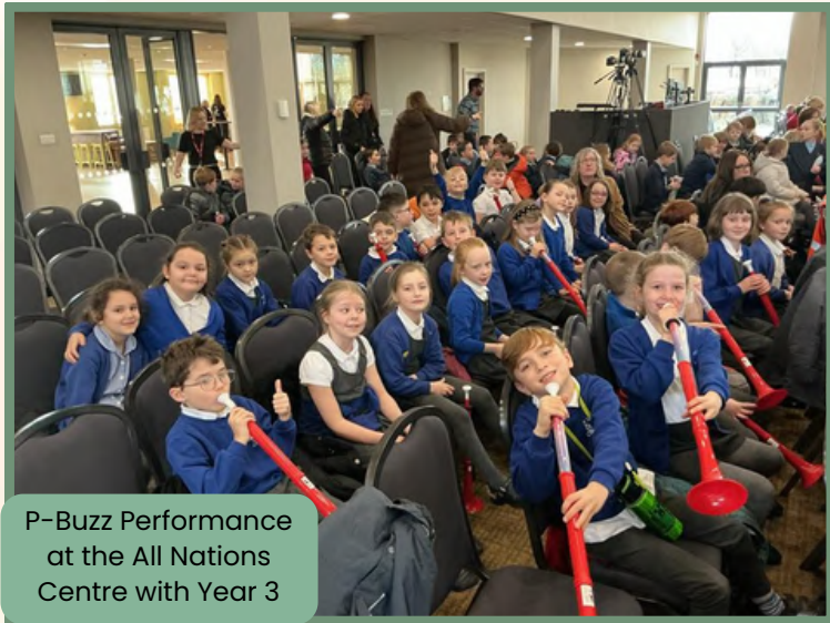
P-Buzz Performance at the All Nations Centre with Year 3