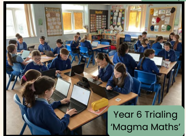
Year 6 Trialing 'Magma Maths'