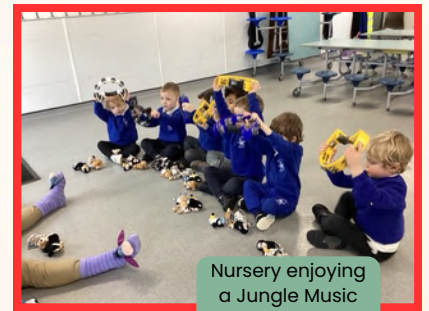
Nursery enjoying a Jungle Music workshop