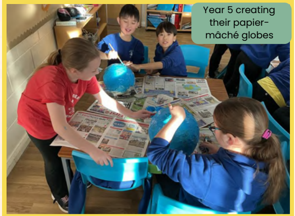
Year 5 creating their papier-mâché globes