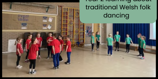
Year 2 learning about traditional Welsh folk dancing