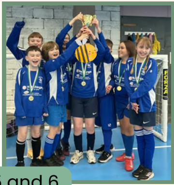
Year 5 and 6 Football