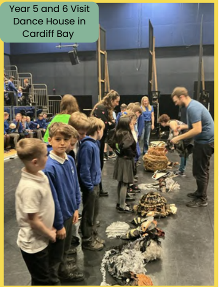
Year 5 and 6 Visit Dance House in Cardiff Bay