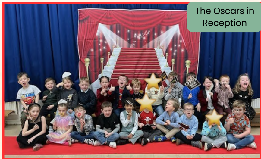
The Oscars in Reception