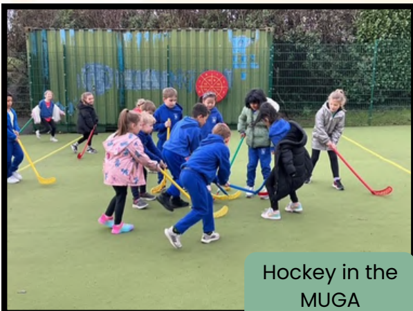
Hockey in the MUGA