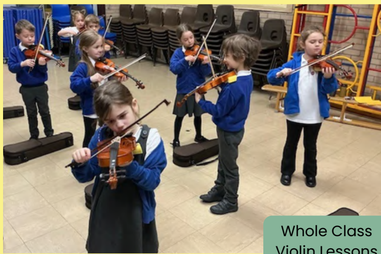
Whole Class Violin Lessons