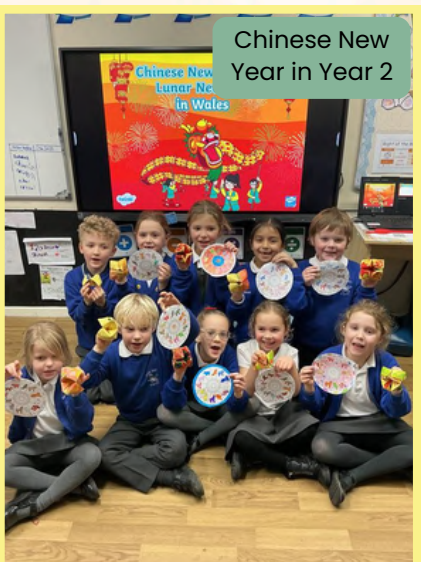
Chinese New Year in Year 2