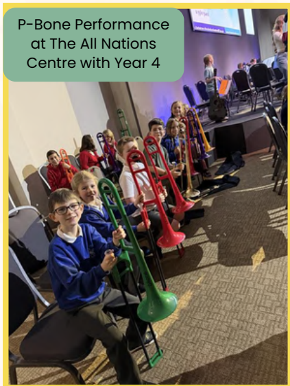
P-Bone Performance at The All Nations Centre with Year 4