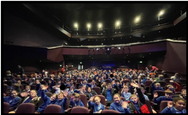
Children about to enjoy Rapunzel at the Newport Riverfront Theater