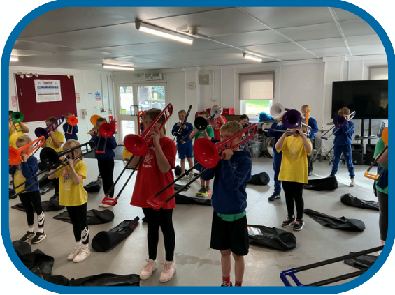
Year 4 starting their pBone trombone journey