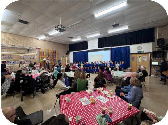
Pupils from Year 2 and 3 entertaining guests during the MacMillan Coffee Morning