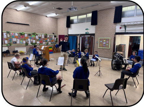
The Bryn Deri Orchestra has returned this week. They are already sounding impressive!