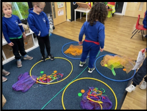
Dosbarth Derbyn exploring symmetry in groups based on the story of a Brazillian Butterfly who had lost her colours