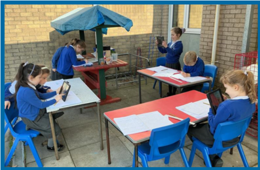
Year 2 experimenting using their scientific investigation skills outside in the improving weather.