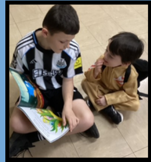
Year 6 reading with infants