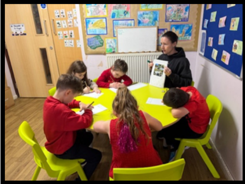
Year 1 children learning about the features of Bute Park in Cardiff