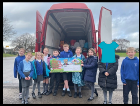
Members of the Eco-Committee receiving a cheque from Rags-2-Riches for all the donations of clothes from the school community!